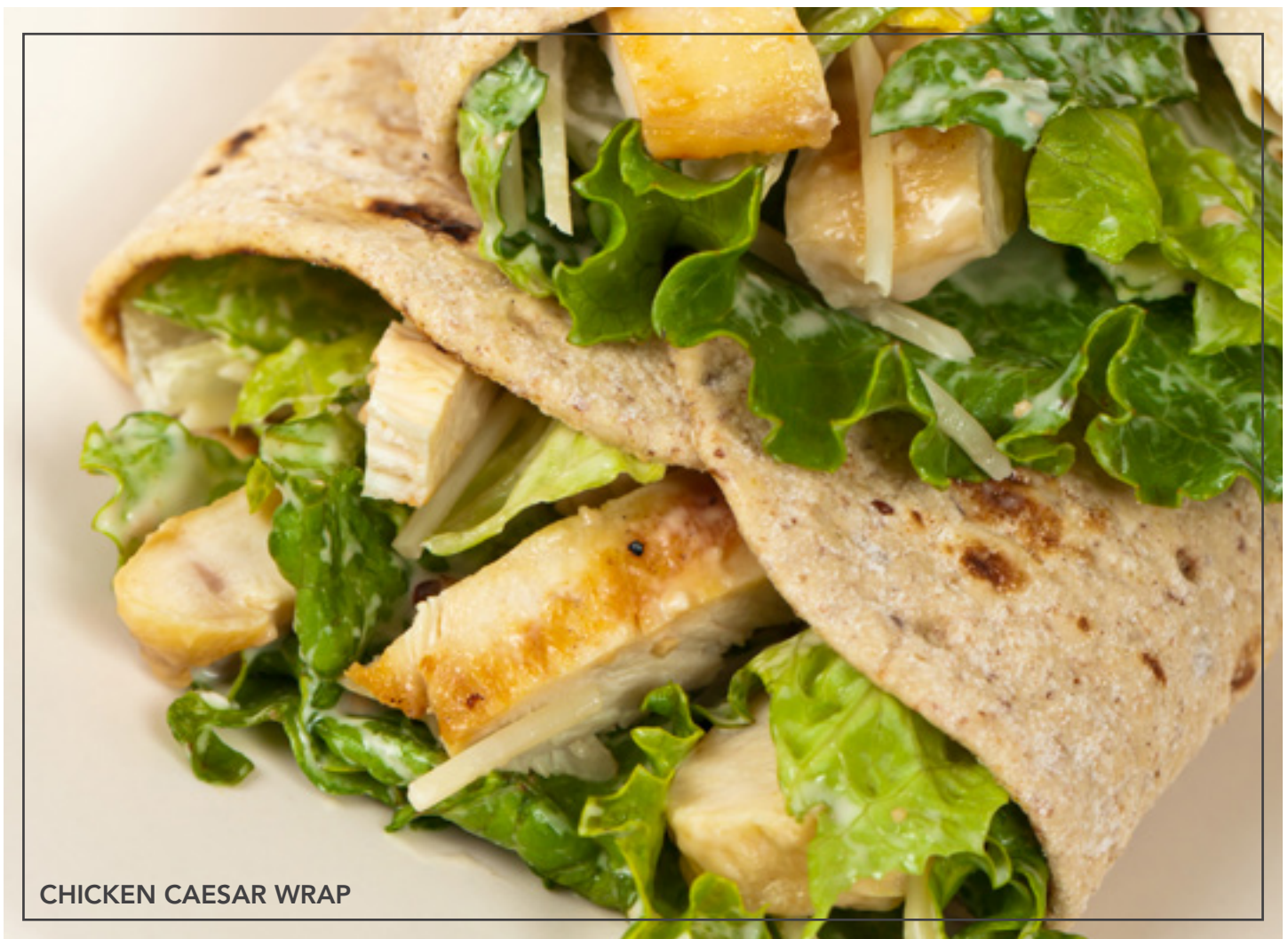
CHICKEN CAESAR WRAP