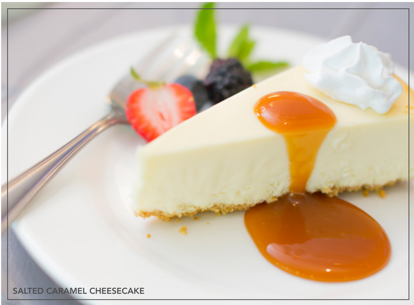
SALTED CARAMEL CHEESECAKE