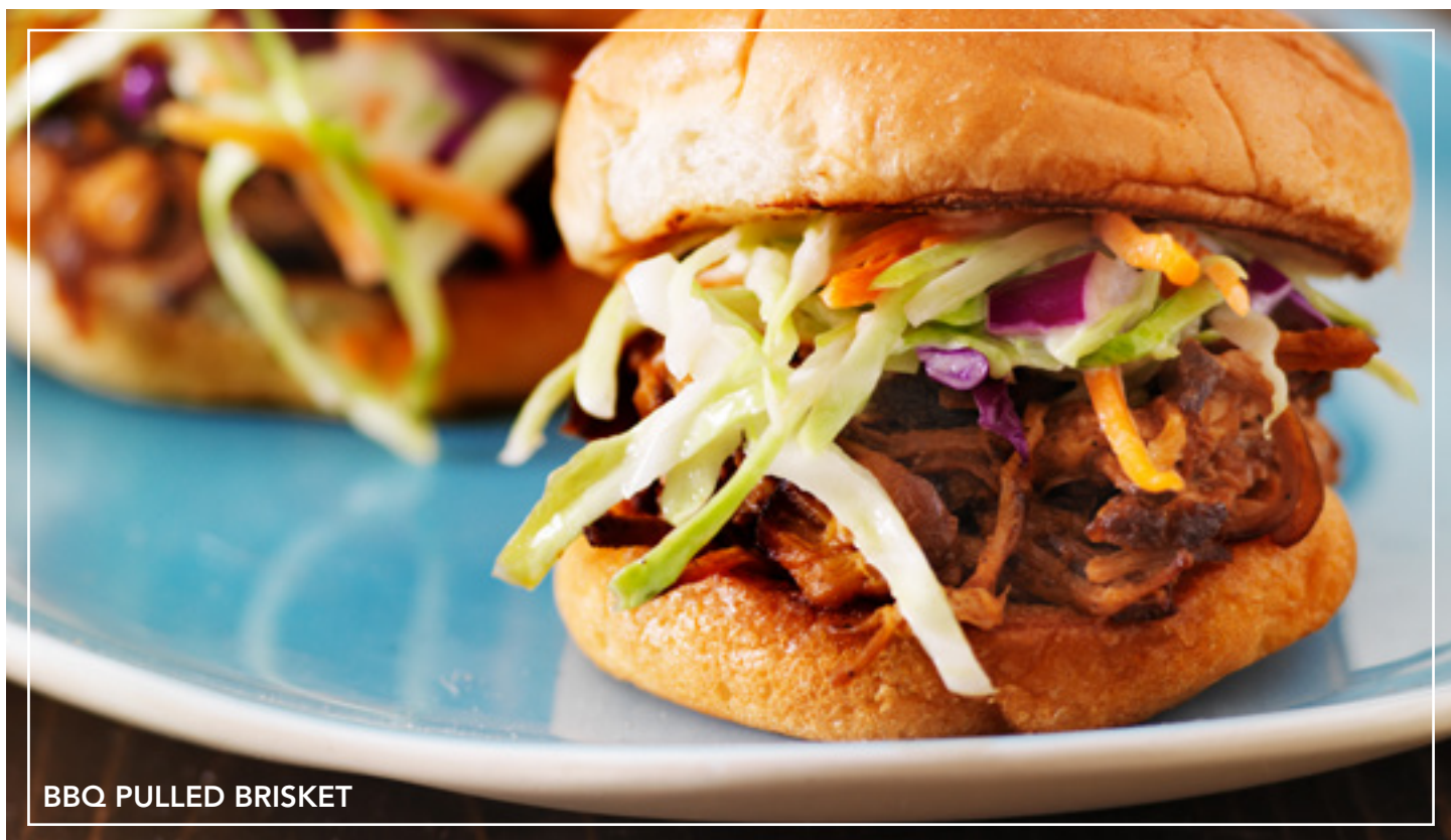
BBQ PULLED BRISKET

Riviera Gourmet Salad Greens (V): Sweet Basil Vinaigrette Chicken Breast Provençal: Tomatoes/Olives Rosemary Pork Loin: Dijon Pan Sauce Pasta Salad (V): Shell Pasta/Tomatoes/Artichokes Balsamic & Cracked Pepper New Potatoes (V) Sautéed Green Beans with Thyme (V) Fresh Fruit Salad (V) with French Baguette/Sweet Butter (V)